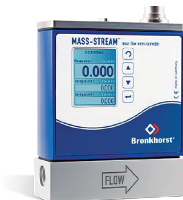
MASS-STREAM D-6310 MFM

Min. flow 0,01...0,2 l/min Max. flow 0,1...2 l/min Pressure rating up to 20 bar Rugged sensor and housing (IP65) Optional integrated TFT display