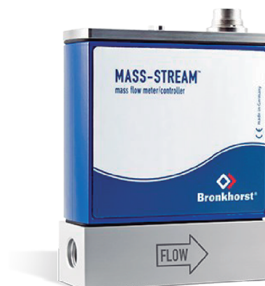
MASS-STREAM D-6341 MFC

Min. flow 0,01...0,2 l/min Max. flow 0,1...2 l/min Pressure rating up to 20 bar Rugged sensor and housing (IP65) Optional integrated TFT display