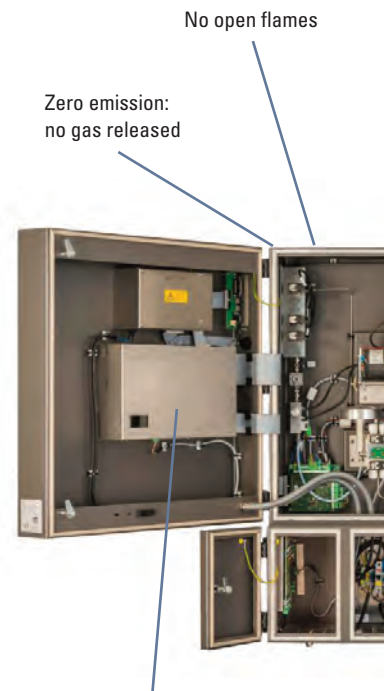
Temperature compensation by software

Best suited method to determine heating values of combustion gases is a Wobbe-type calorimeter which, in contrast to CARI-type calorimeters, measures the heating value of a gas mixture in BTU/scf directly without the need of applying correlation functions or using calibration gases and without any possible influence of catalytic burning effects.