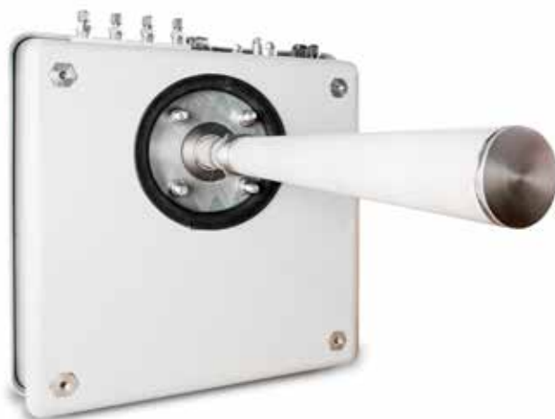
Fig. SILOTEC probe