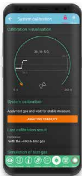
ENOTEC REMOTE APP Simple control of ENOTEC analyzers