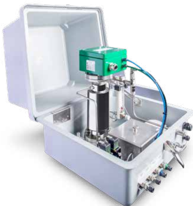
Fig. SILOTEC 8000 analyzer system

After installation and commissioning, the measurement does not require any maintenance. Automatic calibration and the optional blow-back ensure highest reliability and accurate measurement with no drift.