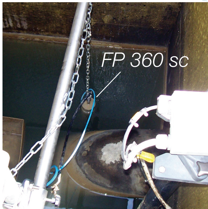
Figure 1. FP 360 sc oil-in-water probe installation in inspection chamber after oil/water separator

In order to reduce the number of lab analyses and to allow for continuous monitoring of mineral oil contamination of the wastewater stream, a Hach Lange FP 360 sc probe was installed in an inspection chamber close to the final wastewater discharge outlet. Due to its high sensitivity to low ppb levels of OIW and specificity to Polycyclic Aromatic Hydrocarbons (PAHs) - a typical mineral oil component - the sensor is capable of providing an early warning with low interference from particles and/or other components in the wastewater. The probe was installed by using a stainless steel chain mounting set. (Figure 1)