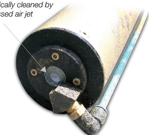
Figure 3. Head of FP 360 sc oil-in-water probe with air blast cleaning system...

Area of measuring window automatically cleaned by compressed air jet