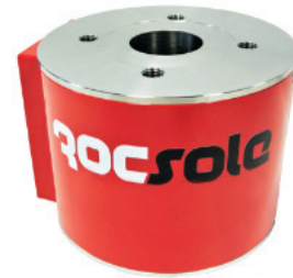
Deposition Watch pipe sensor

SSAB decided to pilot the Deposition Watch pipe sensor developed by Rocsole. The Deposition Watch pipe sensor measures the deposition trend, i.e. the change in the thickness of the deposit.